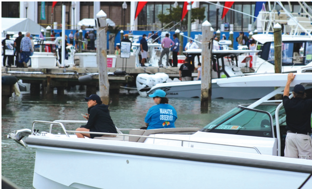
Figure 1. A manatee observer departing on a vessel for a sea trial

Manatee observations, including time, location, and movement, were also recorded on a whiteboard positioned at the observer tent within the marina (Figure 3). Boat show attendees and workers who