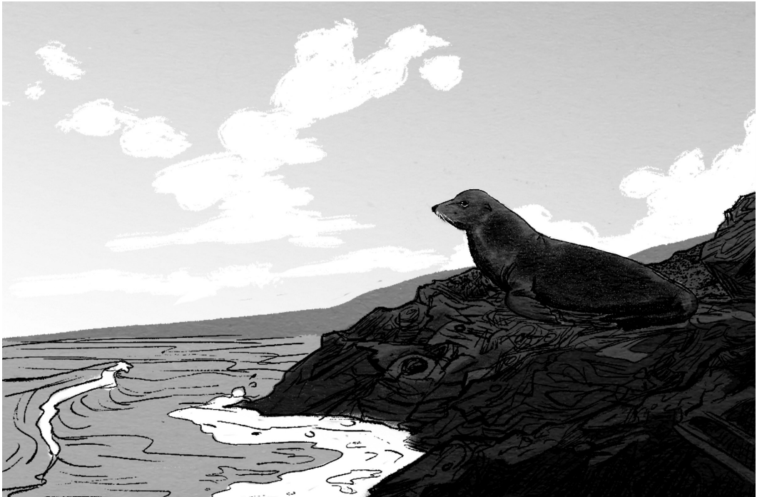
Figure 2. Illustration of a Juan Fernández fur seal observed on the southwestern coast of San Cristobal Island, based on the original black and white photograph taken by the second author (GM) and archived in the Charles Darwin Station Library (Puerto Ayora, Santa Cruz Island, Galápagos Islands). Artwork courtesy of N. Alava Calle.

the otariid was identified as a Juan Fernández fur seal and exhibited a dark brown coloration with a mane from the top of the head to the top of the shoulders; however, it was not possible to visualize the golden yellow to tan-tipped guard hairs in this photo. Of particular attention was the long, slender, and pointed snout or muzzle with a distinctive bulbous rhinarium, and the head shape (Figure 2), which is a characteristic trait for this species that has the longest snout among southern fur seal species (Reeves et al., 2002; Jefferson et al., 2015; Aurióles-Gamboa & Trillmich, 2018). Based on this unique trait, the animal in question did not exhibit morphological features matching those of the two well-known endemic otariids, the Galápagos sea lions ( Zalophus wollebaekii ) and the Galápagos fur seal ( Arctocephalus galapagoensis ), which indeed lack the long, slender, and pointed snout observed in A. philippii .