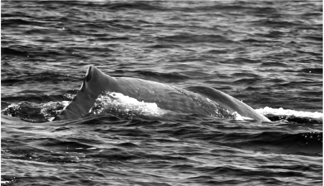
Figure 3. Sperm whale in the Azores on 23 August 2017 with a photo-ID match from the Gulf of Mexico in 2002. The whale is thought to be a male due to its size, presence of a bulge on the head, and lack of a callus on the dorsal fin.