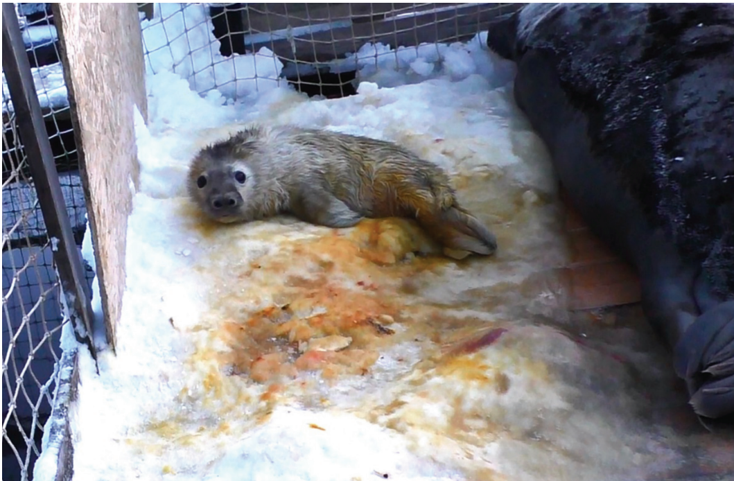
Figure 2. Newborn Atlantic gray seal ( Halichoerus grypus atlantica ) pup, Tim, inside the enclosure

On Day 2, 10 December 2019, after we managed to attract the female into the water using fish, the cage was again cleaned, and the level of the platform was raised. This was done to have a larger dry haul-out area for the mother–pup pair. Also, the pup’s weight was collected (9 kg). Given the daily weight gain documented for this pup at the end of the nursing period (Table 1), we can assume this pup weighed ~7 kg at birth. We discovered that the pup was rather small compared to those pups presented in the literature: gray seal pups have a normal weight range of 10 to 20 kg in the wild (Hall, 2002; Hauksson, 2007). At the Harderwijk Marine Mammal Park, newborn pups weighed around 15 to 17 kg in different years (Kastelein & Wiepkema, 1988, 1990; Kastelein et al., 1991). This pup’s small weight can be explained by the small size of its mother: