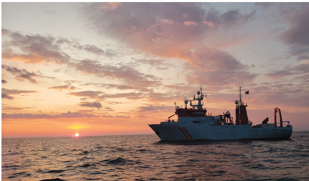
Figure 2. The Norwegian research vessel H. U. Sverdrup II. Picture taken during the 3S-2019-OPS sea trial to study the behavioral response of sperm whales to military sonar.

Sverdrup himself was a student of the well-known Vilhelm Bjerknes, also called the father of modern meteorology. Sverdrup worked as a scientist with the great explorers Roald Amundsen (sailing six years together in the Arctic on the vessel Maud ) and Fridtjof Nansen. In the early years of World War II, Sverdrup and Munk developed a theory for surf waves (published after the war in Sverdrup & Munk, 1946a, 1946b, 1947), which enabled the allies to forecast conditions for amphibious landings. These forecasts were used