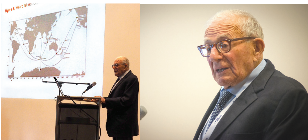
Figure 3. Walter Munk at ESOMM-2014 giving his opening lecture. The slide in the background shows the propagation paths of the Heard Island Experiment.

Within a day of our invitation to Walter to come to Amsterdam to do the opening lecture of the ESOMM-2014 conference, his positive reply came back from La Jolla with the words, "Yes, we would certainly consider this." On Monday, 8 September 2014, following the opening remarks of Rear-Admiral Bauer of the Royal Netherlands Navy, Walter did his opening lecture, and the conference room at the Naval Barracks was whisper quiet for 40 minutes (Figure 3). The paper of this opening lecture was published in the previous