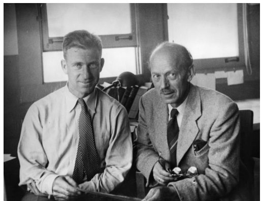
Figure 1. Walter Munk and Harald Sverdrup around 1940

Early in 2014, the idea arose to invite Walter Munk to be the opening speaker for the ESOMM-2014 conference that would be held later that fall. Walter had been working on ocean acoustic tomography from the very beginning. It was actually his original idea, together with Carl Wunsch from MIT (Munk & Wunsch, 1979), to exploit underwater acoustics for climate and oceanography purposes. This idea eventually led to the famous Heard Island Feasibility Test in 1991 where signals from a sound source in the Southern Ocean were received on the other end of all oceans, up to 20,000 km away from the source (Munk & Baggeroer, 1994; Munk et al., 1994). For this experiment, the permitting process was a delicate procedure, as described by Von Storch &