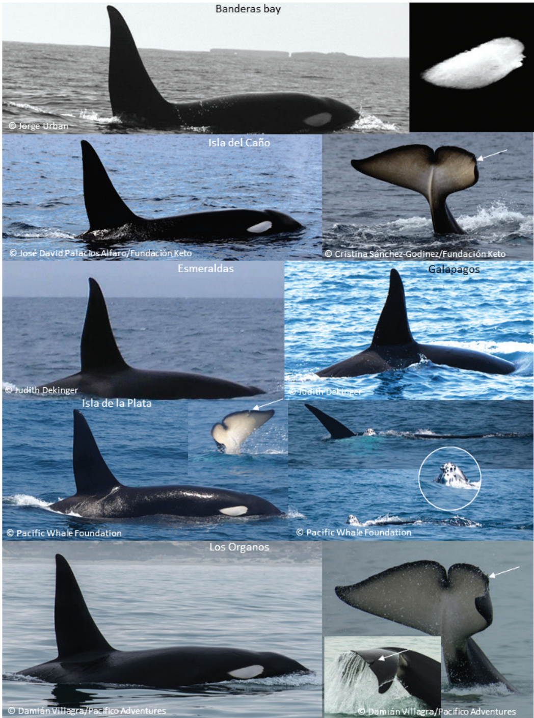
Figure 2. Photographs of the individual identified as Phantom sighted at each locality. The characteristic eye patch is presented next to the Banderas Bay photograph (Mexico). White arrows point to the distinctive notch in the fluke. Views of Phantom near a humpback whale calf are visible at the right side of the Isla de la Plata photo.