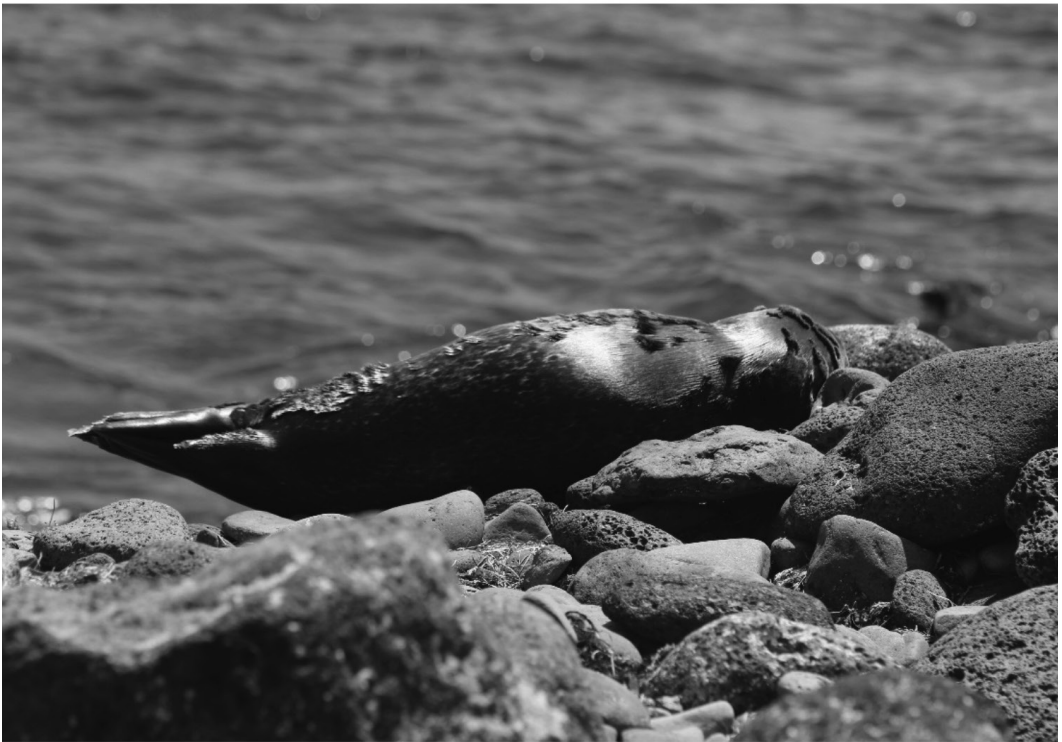
Figure 2. Eastern Pacific harbor seal pup recorded at Punta Sur, Guadalupe Island, Baja California, Mexico