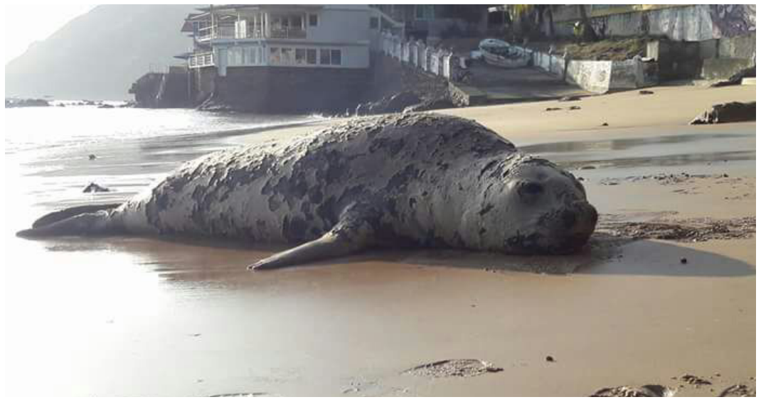
Figure 2. The specimen lying on the beach at Taboga

2015). In immature males, molting occurs specifically between December and January (Ling & Bryden, 1981). Photographs of the elephant seal at Taboga show that the animal was evidently in a molting period and that is probably the reason it was sighted on land. Therefore, the Taboga specimen most probably came from the southern hemisphere. Most tagged elephant seals found in South America originate in the Valdés Peninsula, Argentina (Lewis et al., 2006), and the Falkland/