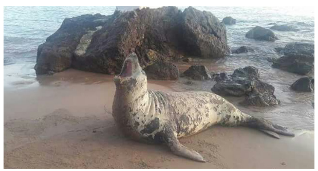
Figure 3. The specimen reacting to the approach of a person at Taboga