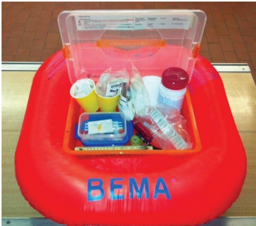
Figure 1. A floating device to contain items required for intervention and care