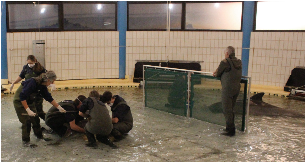
Figure 3. Separation walls between mom and calf, if needed