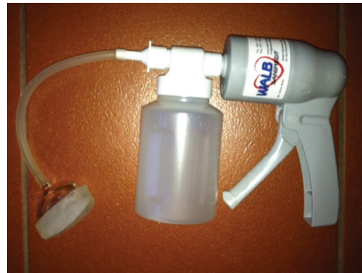
Figure 2. Mammary (breast) pump developed by Walb for dolphin application