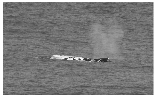
Figure 3. Piebald adult humpback whale ( Megaptera novaeangliae) observed on 2 August 2014 off Seaview (Port Elizabeth, South Africa)

various individuals may carry the recessive allele despite no other hypopigmented humpback whale having been reported in the C1 breeding substock. Considering the known humpback whale migration patterns (IWC, 2011), it seems unlikely that one of the Australian anomalously pigmented humpback whales could have fathered this calf. Other possible causes could be pollution (e.g., causing genetic mutation or endocrine disruptions; Pawalek & Körner, 1982; Bortolotti et al., 2003) or dietary deficiencies (Sage, 1962), although the aetiology of the latter is poorly understood.