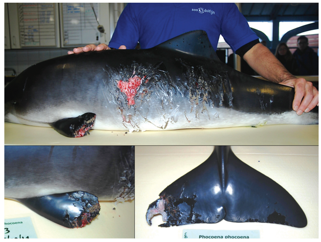
Figure 1. The harbour porpoise ( Phocoena phocoena ) just admitted to the rehabilitation centre, showing severe injuries on its left flank and pectoral fin (top), pectoral fin (bottom left), and fluke (bottom right); pictures taken on day of stranding after arrival at SOS Dolfijn.