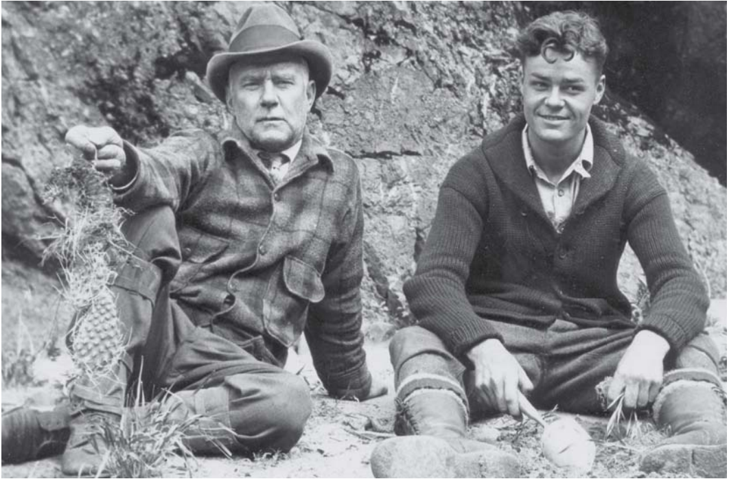
With father in Hell's Canyon in 1927

is the floor, where a bird is held captive during its natural migratory periods. The bird is obliged to sleep from time to time on black-ink pads arranged around its feeding station. The upper, wider end is a virtual sky. It is a lid that can be changed to simulate a changing length of day or a night patterned with stars. A horizontal screen of white cloth hangs below the "sky." When the bird, feeling the migratory urge, tries to reach the sky it is blocked by the screen, where it leaves inky footprints. By counting the number of prints and noting their compass bearing, it is possible to estimate the strength of the migratory urge and the direction toward which the bird was instinctively headed.