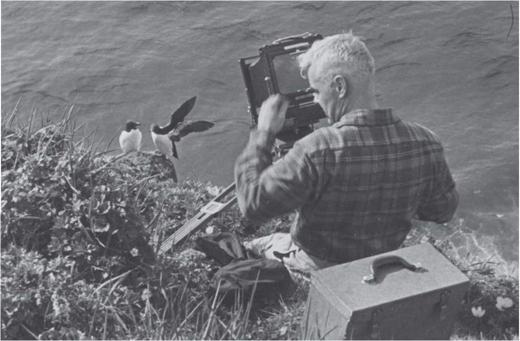
Photographing Murres in 1945

cooperation. Not the instinctive cooperation of beavers, building together their dams, canals, and lodges, nor the cooperation of termites, constructing in total darkness their million-member apartments. Reasoned cooperation calls upon the individual, voluntarily and thoughtfully, to give up certain rights, desires, and demands for the benefit of the common good.