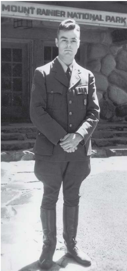
As ranger naturalist in 1934

Conservation as a national ethic came into everyday language a century ago when Teddy Roosevelt was in the White House. His friend, Gifford Pinchot, a professional forester, had put a new