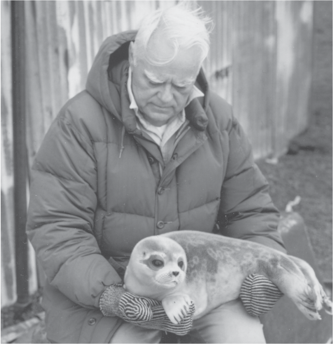
In Alaska with seal pup in 1968

Navy for asking a question that can have no meaningful answer.