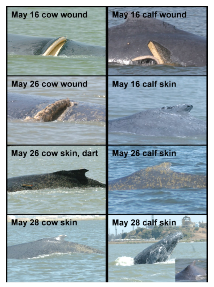
Figure 2. Changes in skin and wound conditions in the mother and calf humpback whale over 16 d

proximity to the whales at source levels exceeding 180 dB re: 1 \mu Pa. After the use of a fire hose on 25 May, the whales turned 90° towards the bank of the river, and then turned back north at 100 m from the fireboat. This intervention was repeated three times, and the same response was observed.