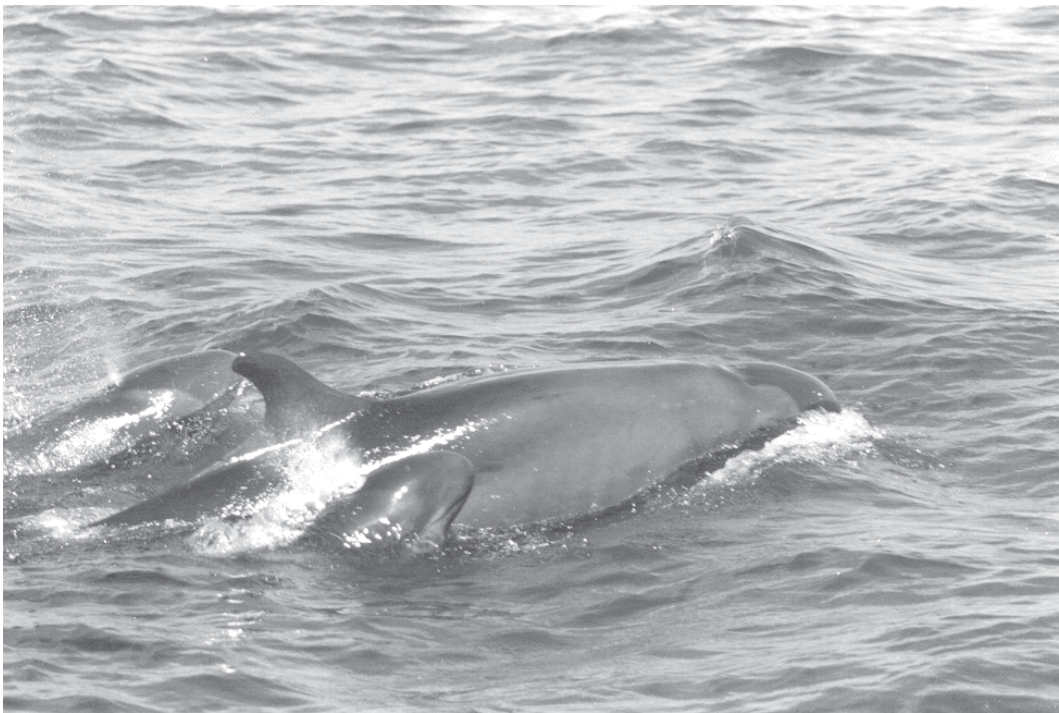
Figure 2. False killer whales sighted north of Koh Rong Samlaem Island; this group consisted of 45 (33 to 61) individuals and was the first record of this species for Cambodian waters.

Line-transect analyses were not possible as a result of the limited sightings obtained of each species. Based on the above surveys, however, the area with the highest encounter rate is the Koh Kong coastline from Koh Kong Island to the Thai border (0.41 cetaceans/linear km or 0.06 encounters/linear km surveyed). The offshore surveys (around Koh Tang and Koh Polou Wai archipelagos) show a higher number of cetaceans/linear