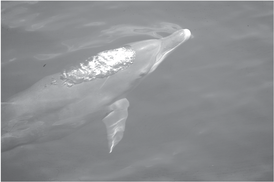
Figure 3. An Indo-Pacific bottlenose dolphin sighted just north of Kompong Som Bay; this species appeared distinct from the larger offshore form of bottlenose dolphin based on a longer rostrum, spotting on the ventral surface, and smaller group size.

Interview Surveys —As a direct result of interviews, a number of skeletal specimens were recovered, and potentially significant levels of by-catch became apparent—particularly with certain net types and fishing techniques. Most interviewees were either experienced fishers or local traders of various harvestable marine resources. All were familiar with marine mammals and reported seeing cetacean groups with varying regularity. A series of laminated illustrations/photographs was shown to each interviewee to judge their reliability at identifying the species that occur/are likely to occur in Cambodian waters. Responses indicated that at least some interviewees were not familiar with even the most likely species to be found in their area (e.g., Irrawaddy dolphin), although this may be due to their being unaccustomed to relating photographs/illustrations to what they observe in reality.