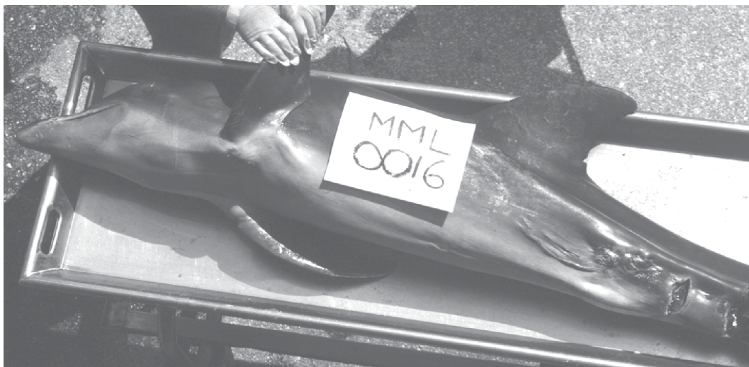
Figure 4. Four-year-old male dolphin calf, the son of a begging mother, that died within six weeks of being observed begging in the region occupied by Beggar; note the severe emaciation, presumed boat propeller cuts on the peduncle, healed entanglement scars at the base of the pectoral flippers, and shark bite scar.

(Wells & Scott, 1997). Although the specific role of begging in the sequence of events that led to this dolphin's demise cannot be determined, it is clear that this animal, a known beggar and the son of a begging mother, was involved in a surprisingly high number of adverse human interactions.