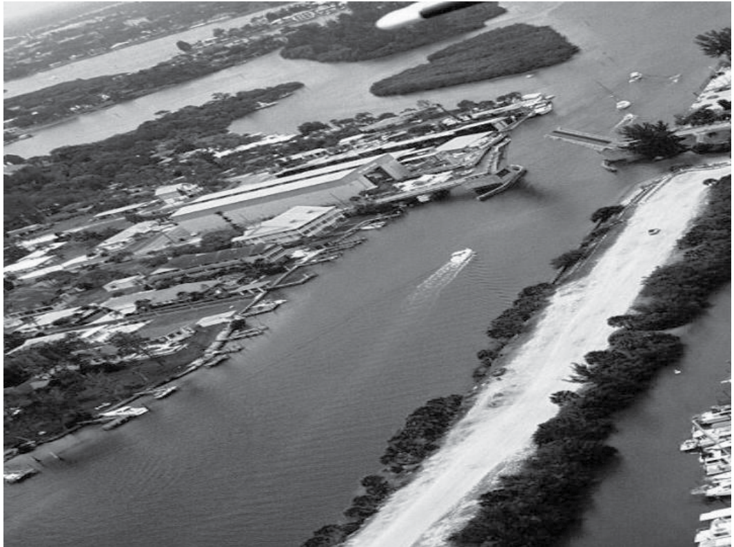
Figure 1. Aerial view of Albee Road Bridge study area, near Sarasota Bay, Florida; north is to the left.

We recorded the date, time, dolphins present, boat type, size, and identification information, including private vs. commercial ownership (as possible); a description of the initiation of each interaction attempt; and the dolphin's behavioral responses. Interactions were defined as follows: attempts to interact with the dolphin by pounding on the side of the boat, splashing the water,