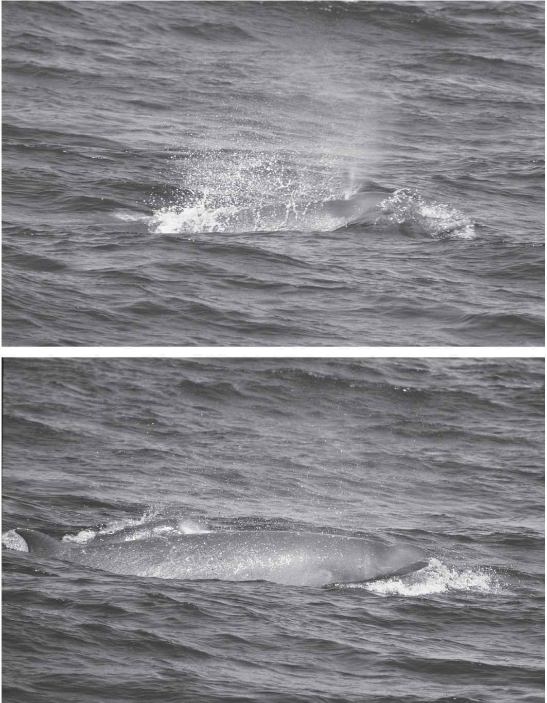
Figure 2. Two Longman's beaked whales surfacing, Maldives, 11 February 2003. Upper photo: Note slight forward projection to blow, melon, and distinct beak partly obscured by water, and indistinct dark bar immediately posterior to blowhole. Lower photo: Note shape and relative size of dorsal fin on nearer animal; pale melon clearly demarcated from dark back on second (apparently smaller) animal.