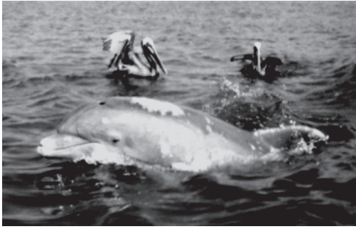
Figure 2. Habituated bottlenose dolphin that follows a commercial crab boat; apparent skin lesions make this animal easily recognizable.

the skin lesions (1998 to 2000) did not reveal an increase in coverage or a change in appearance. The combination of the unusual behaviors this animal exhibited, in addition to the distinguishing markings along the body, made the individual easily recognized and resighted.