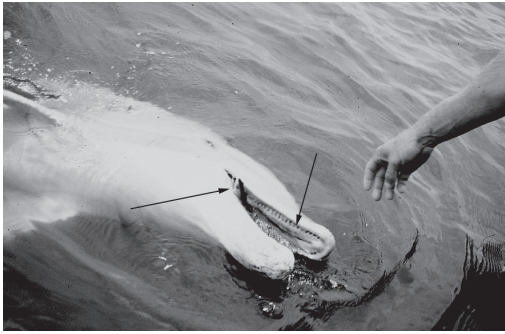
Figure 3. The known bottlenose dolphin approaches a commercial crab boat with a fishing lure lodged in its mouth. The animal's worn dentition is apparent.

dolphin feeding on discarded bait fish, there was a concern that the dolphin's natural foraging skills could have been altered; however, sightings of the dolphin from watercraft other than fishing boats documented the dolphin naturally foraging (probable feed) and traveling with two other dolphins ( n = 3 sightings; pers. ob., 2001).