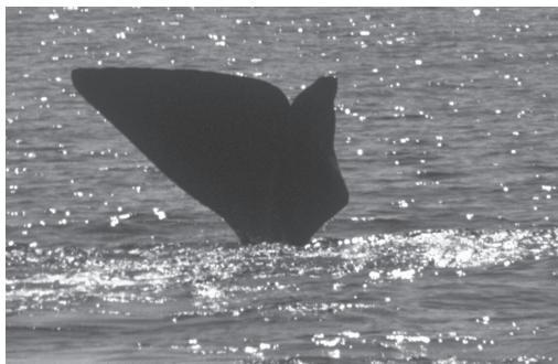
Figure 2. Photograph of an injured sperm whale sighted off the coast of Provence (France) in August 2003